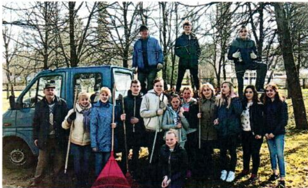
Young people are helping to clean Elderly Care center environment

This time I want to tell you about young people who participated in a long-term training cycle. During the training they gained the knowledge about the labour market. Also, they learned about volunteering and had possibility to work. 'Volunteering is an experience that helps to develop skills and find out what can be your favourite activity,' said Antanas, one of the training mentors.